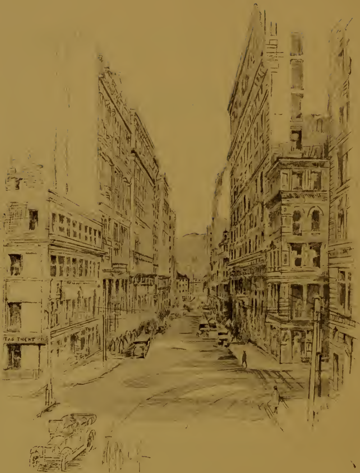
State Street, with the Crown Coffee House Site in the middle background, 1916